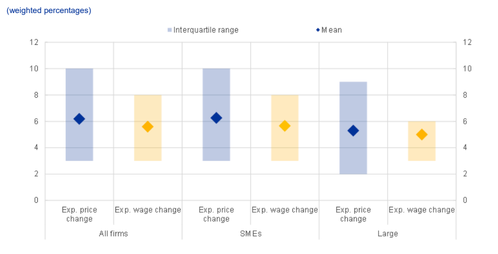
Chart 2 Average expected price and wage changes

Base: All enterprises. The figures refer to round 28 of the survey (October 2022-March 2023). Notes: Average euro area firm expectations about selling prices and wages of current employees for the next 12 months, along with interquartile ranges, using survey weights. The statistics are computed after trimming the data at the country-specific 1st and 99th percentiles.